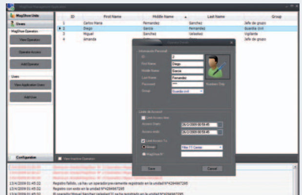
NMC-3; Flexible Operator Management