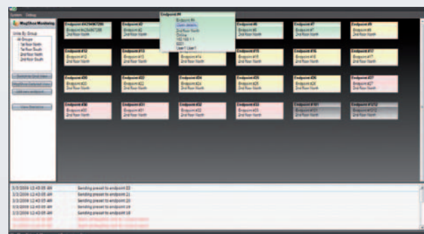
Colour-coded Detailed Status View display