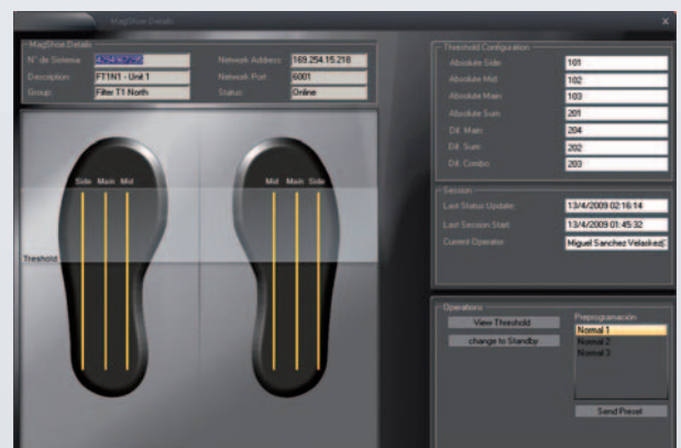
Individual MagShoe detail level